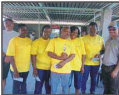
1st Prize over all winner - Novice - Peer Educators