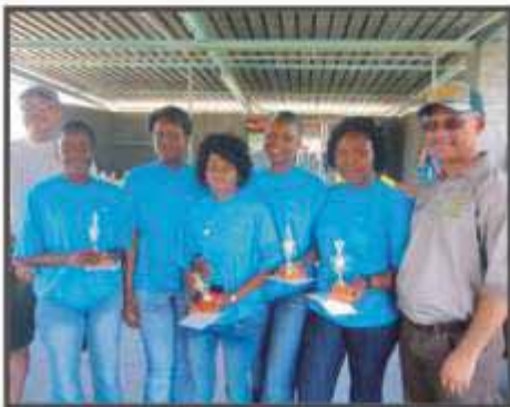
Best Team Exercise - Novice - Mining Big 5