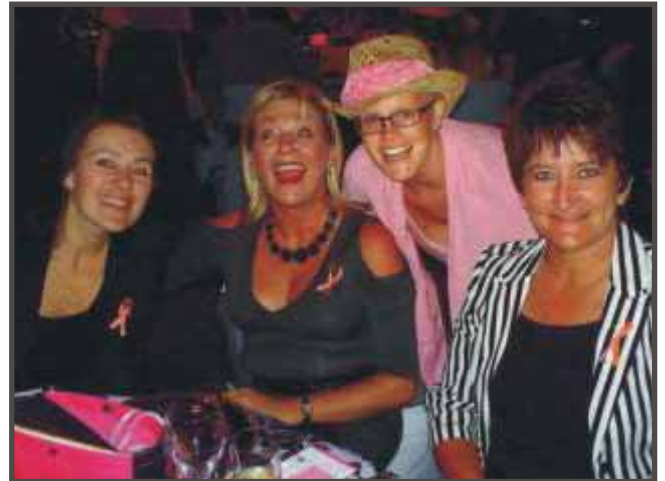
"Mnet Pink Drive Annual Lunch".