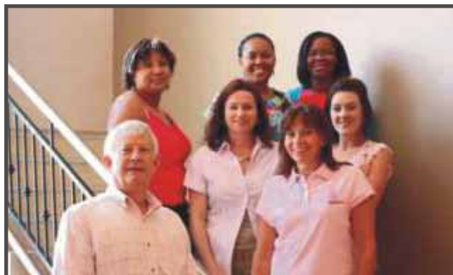
"Foskorites Looking Pretty in Pink" for the cause