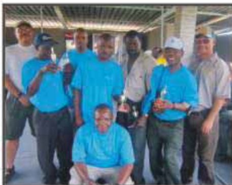
1st Prize Over all winner - Advanced - TSS Mechanical B