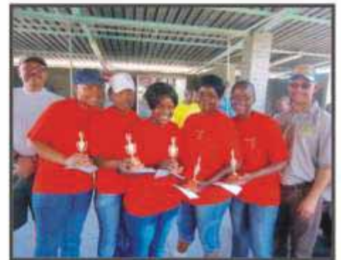
2nd Prize Over all winner - Novice - Con Lab Divas