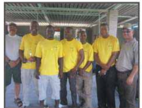
2nd Prize Over All winner - Advanced - Mining Workshops