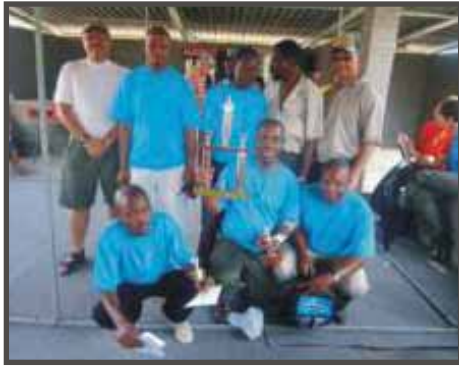
Best Team Exercise - Advanced - TSS Mechanical B