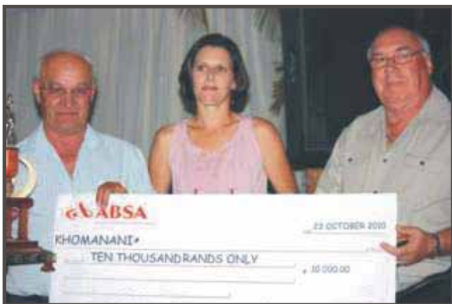
The winning 4-ball donates R10 000.00 to a charity of their choice